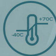
USABLE IN HARSH ENVIRONMENTS