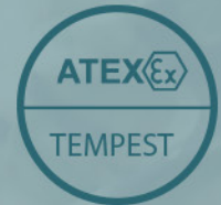
ATEX AND TEMPEST QUAL.