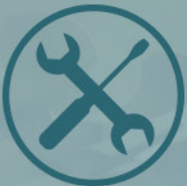
MAINTENANCE & UPGRADES